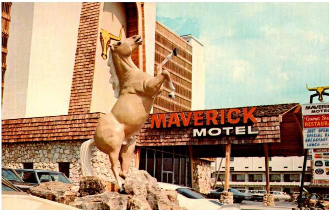
Maverick Motel, Ormond Beach, Fla. - ca. 1970s.