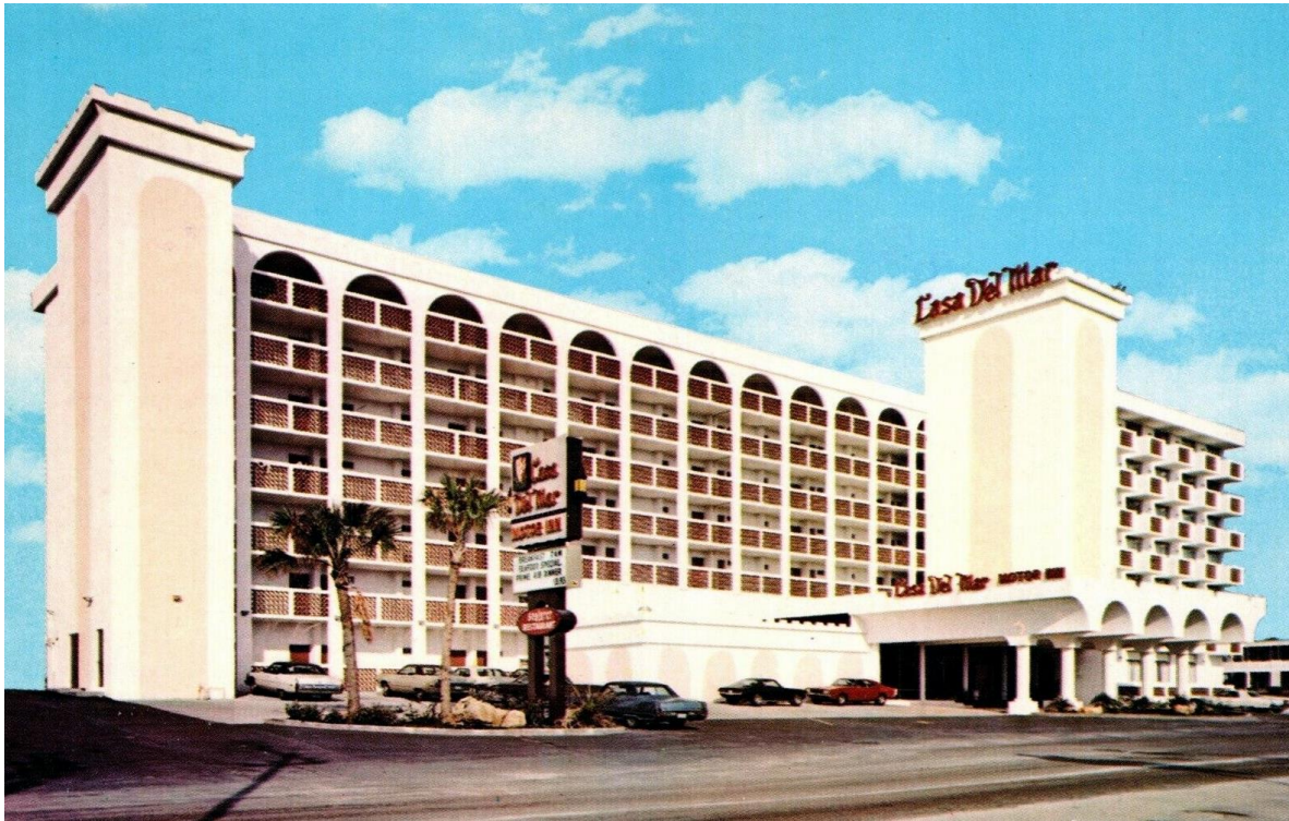
Casa Del Mar Oceanfront Hotel, Ormond Beach, Fla. - ca. 1970s.