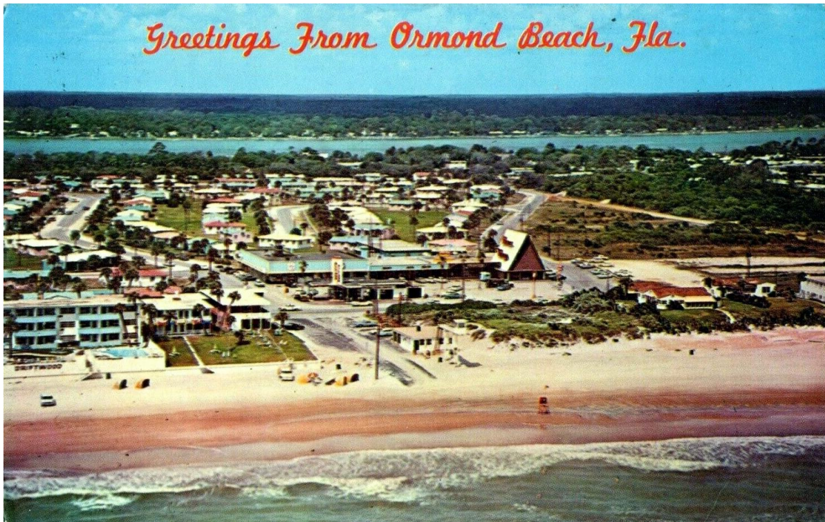
(Aerial View from the Beach) - Greetings from Ormond Beach, Fla. - ca. 1970.