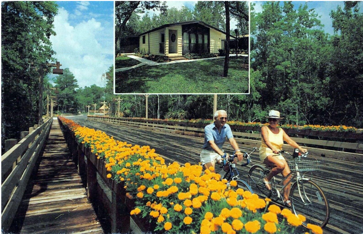
Bear Creek Path, Ormond Beach, Fla. - ca. 1970s.