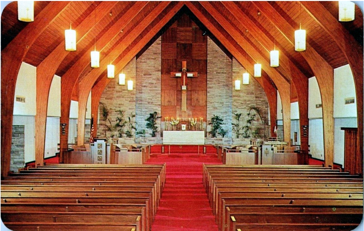
St. James' Episcopal Church, 44 S. Halifax Drive, Ormond Beach, Fla. - ca. 1970s.