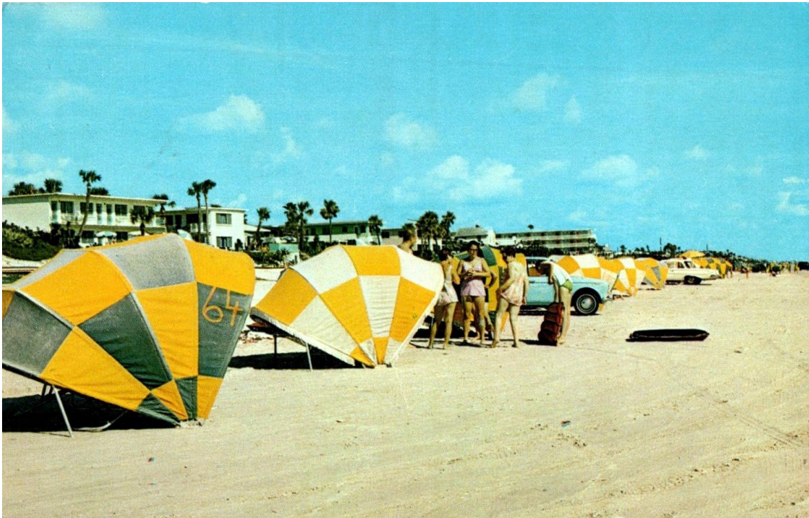
Beach Umbrella Scene, Ormond Beach, Fla. - ca. 1970s.