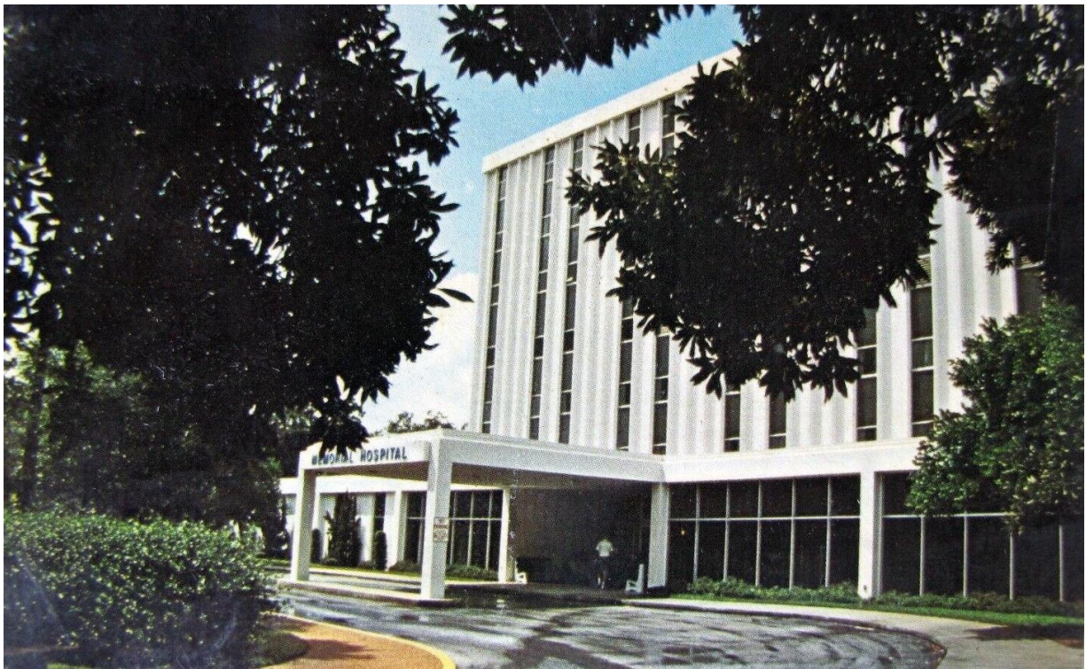
Memorial Hospital, Ormond Beach, Fla, - ca. 1980.