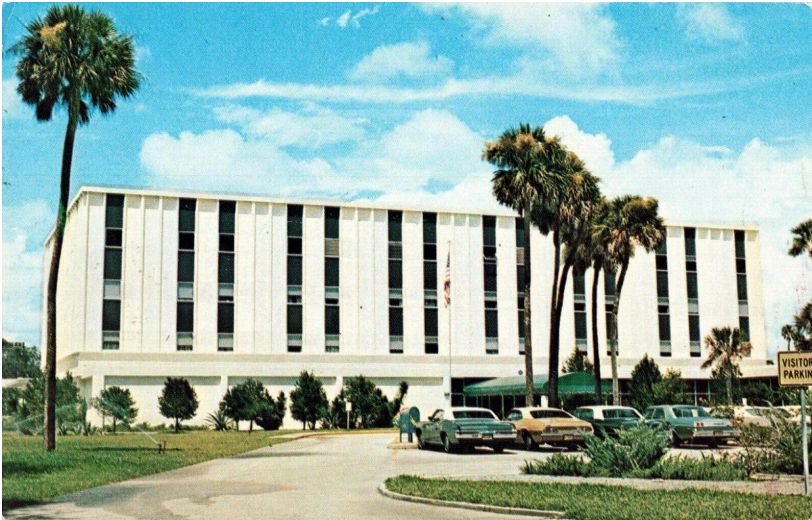
Ormond Beach Memorial Hospital, 875 Sterthaus Ave. - ca. 1980.