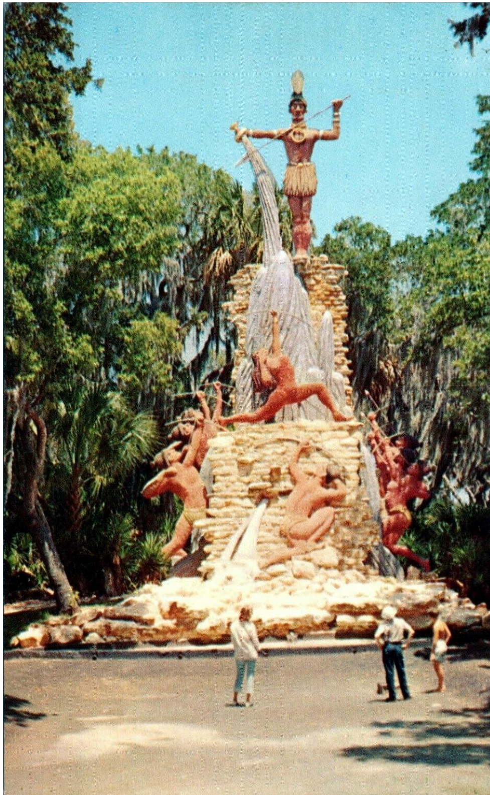
Giant Chief Tomoka Sculpture in Tomoka State Park, Ormond Beach, Fla. - ca. 1970.