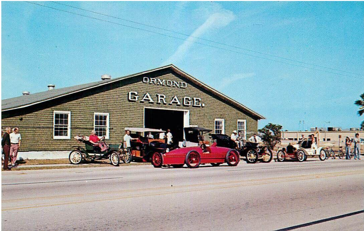
Ormond Garage before the Catastrophic Fire (1906 Stanley Replica) Ormond Beach, Fla. – ca. 1975.