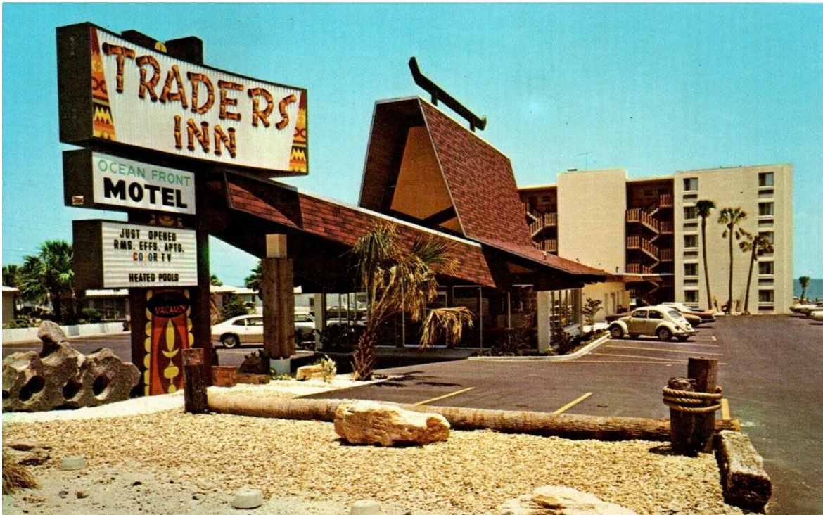
Traders Inn, Ocean Front Motel, Ormond Beach, Fla. - ca. 1970s.